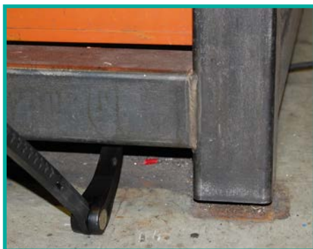
Lifts a heavy cabinet

*** Lifting capacity is 600 lbs, 1000 lbs, and 2000 lbs respectively.