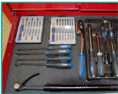
Easily stores in tool boxes